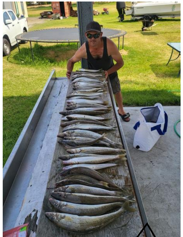
Nice bag, a good days work.